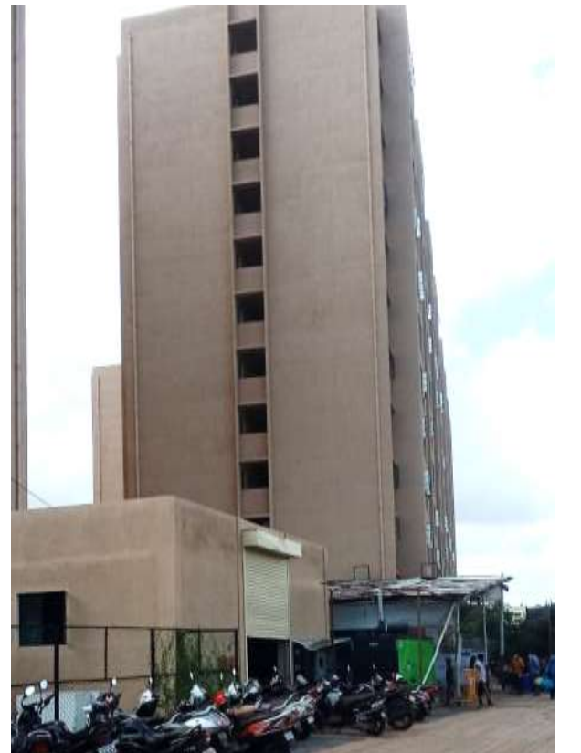
SRA Buildings, Viman Nagar, Pune